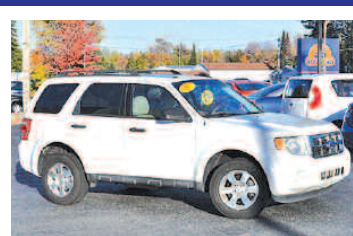
2010 Ford Escape