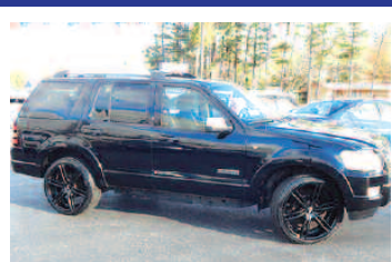
2007 Ford Explorer Limited 3 rd row seat, low miles, LOADED.