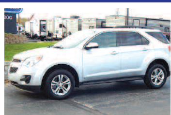
2010 Chevy Equinox LS Looks and drives like new.