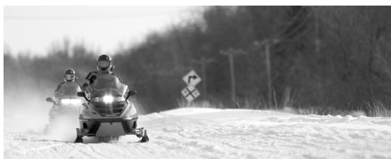
Michigan's snowmobile program is 100-percent funded by trail permit and registration dollars. To purchase a snowmobile trail permit for the 2017-18 season and ride more than 6,000 miles of designated trails and thousands more miles of public roads and lands, visit www.michigan.gov/snowmobiling .

"Snowmobilers are encouraged to purchase their snowmobile