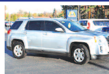
2010 GMC Terrain SLE