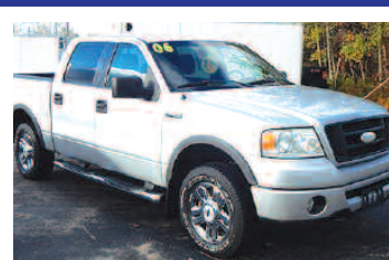
2006 Ford F-150 XLT 4x4 Lather, 4 door, bedliner, tow pkg.