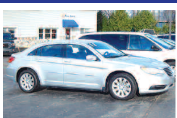
2012 Chrysler 200 30 MPG.