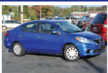
2012 Nissan Versa SV