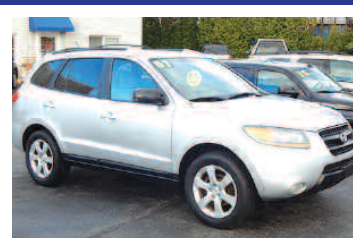
2007 Hyundai Sante Fe Nice SUV.