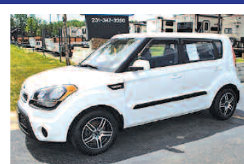
2013 Kia Soul