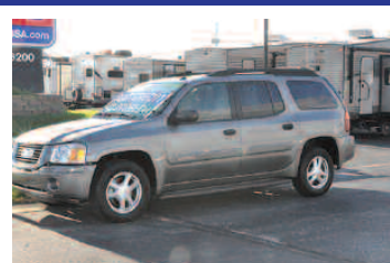
2005 GMC Envoy XL 4WD, 3 rd row seat, tow pkg.